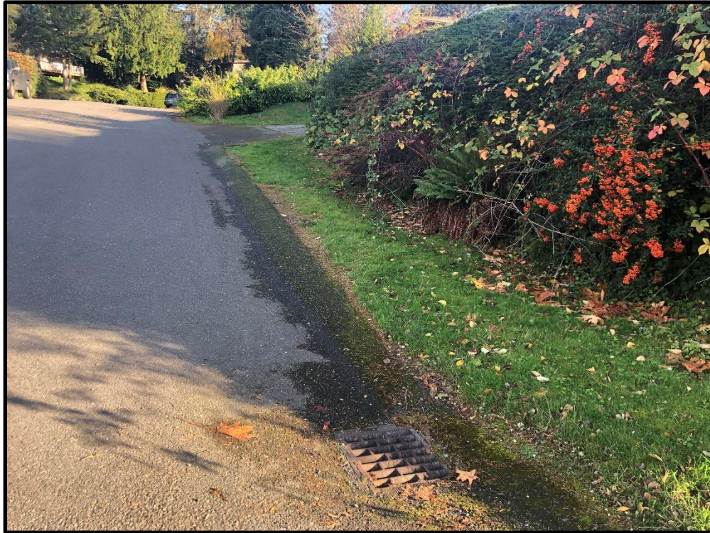
Element 3: Type 1 CB at project frontage on SE 34 th PI