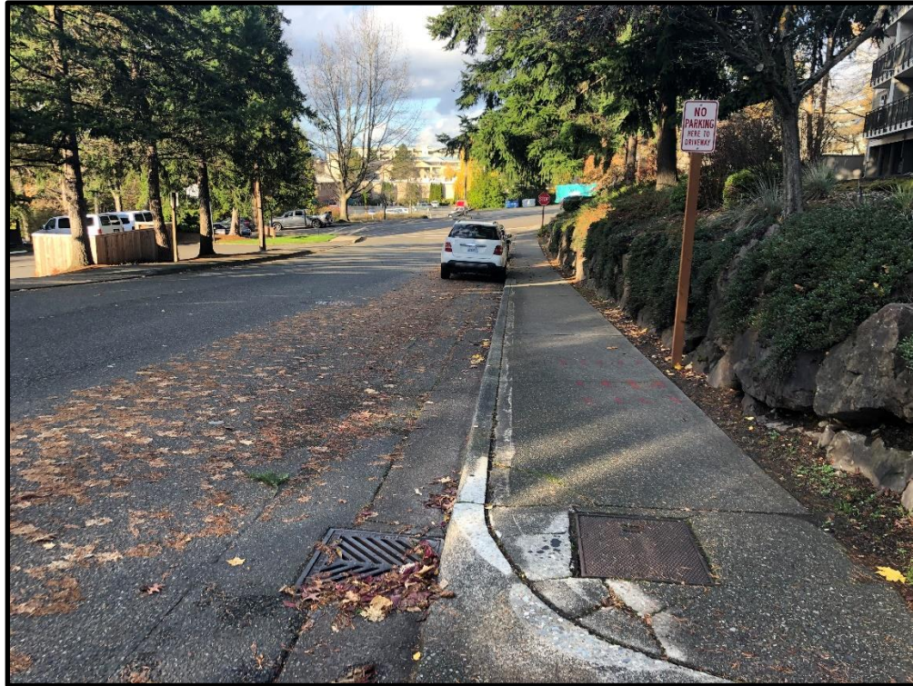
Element 6: Type 1 CB on 80 th Ave SE