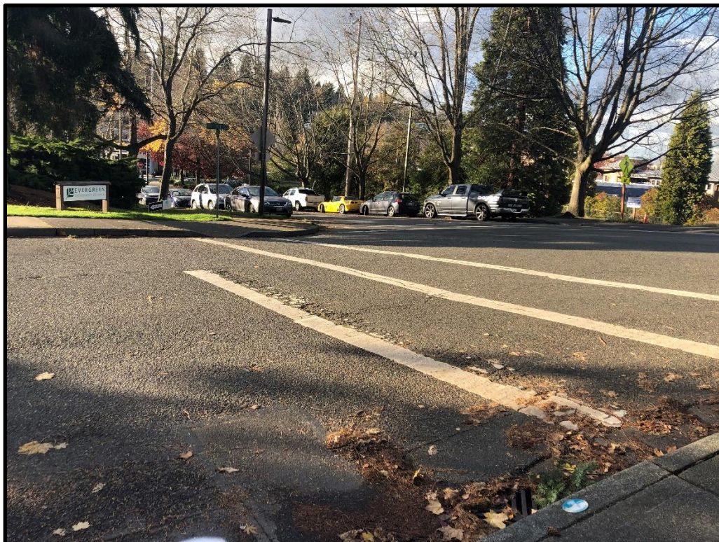
Element 10: Type 1 CB at intersection of 80 th Ave SE and SE 32 nd St