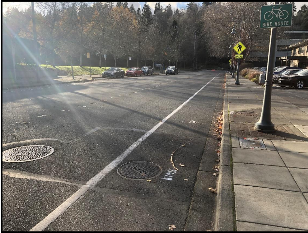
Element 17 & 18: Two Type 2 CBs on SE 32 nd St