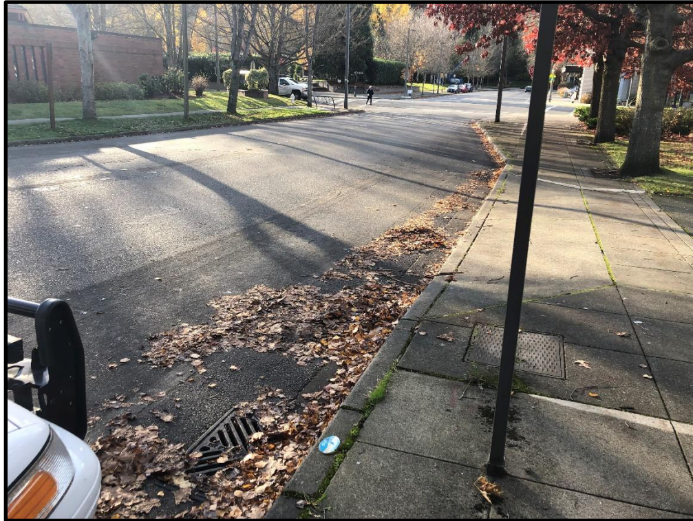
Element 13: Type 1 CB on SE 32 nd St