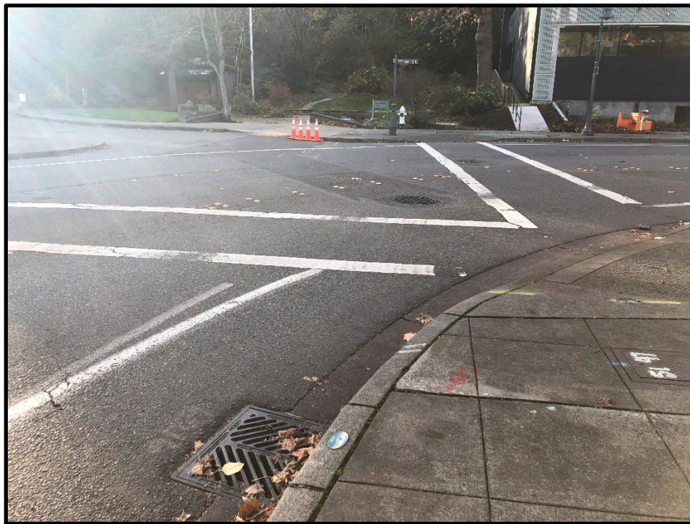
Element 19: Type 1 CB at intersection of 77 th Ave SE and SE 32 nd St at ¼ mile downstream of the site