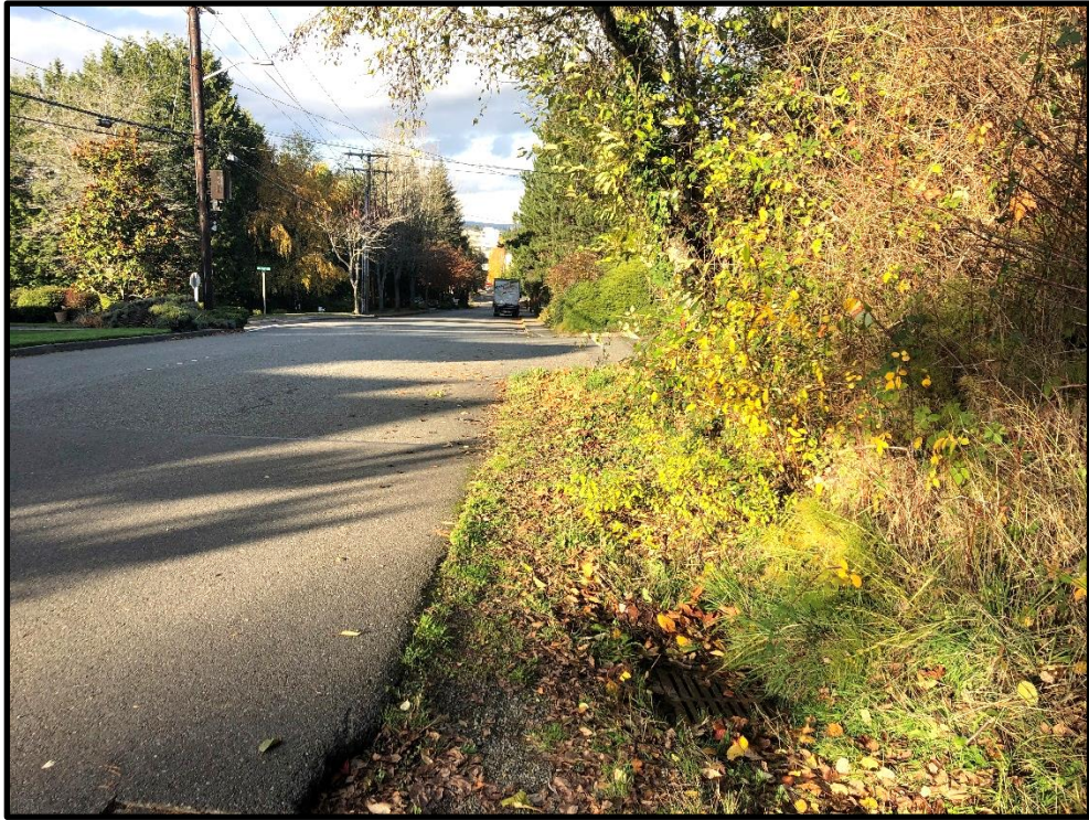
Element 1: Type 1 CB along western project frontage on 80 th Ave SE