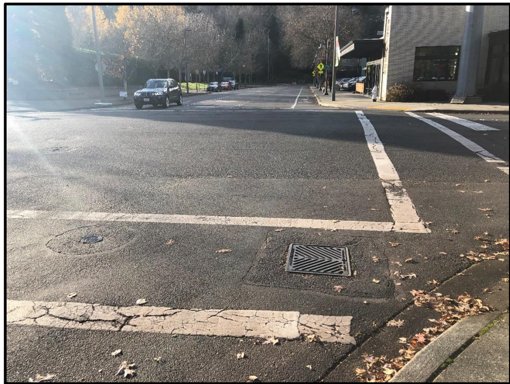
Element 15: Type 2 CB (per Mercer Island Records) at intersection of SE 32 nd St and 8 th Ave SE