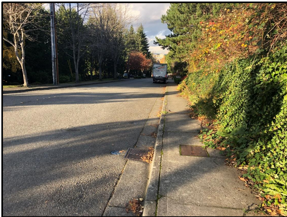
Element 4: Type 1 CB on 80 th Ave SE