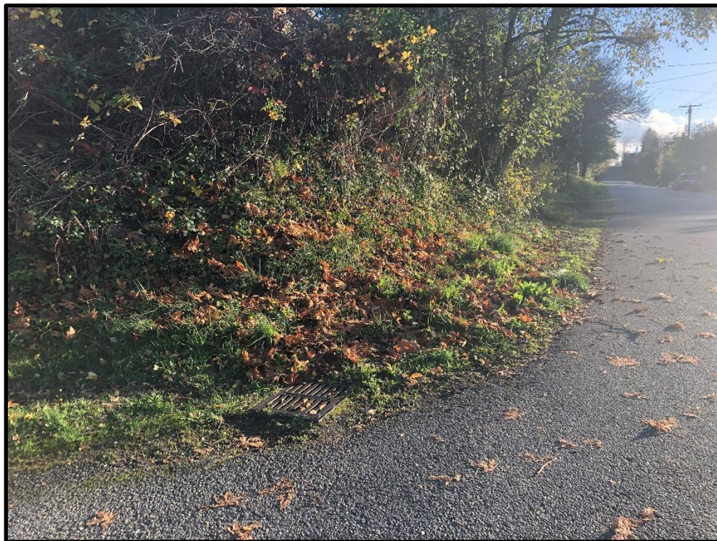
Element 2: Type 1 CB at project frontage at 80 th Ave SE & SE 34 PI intersection